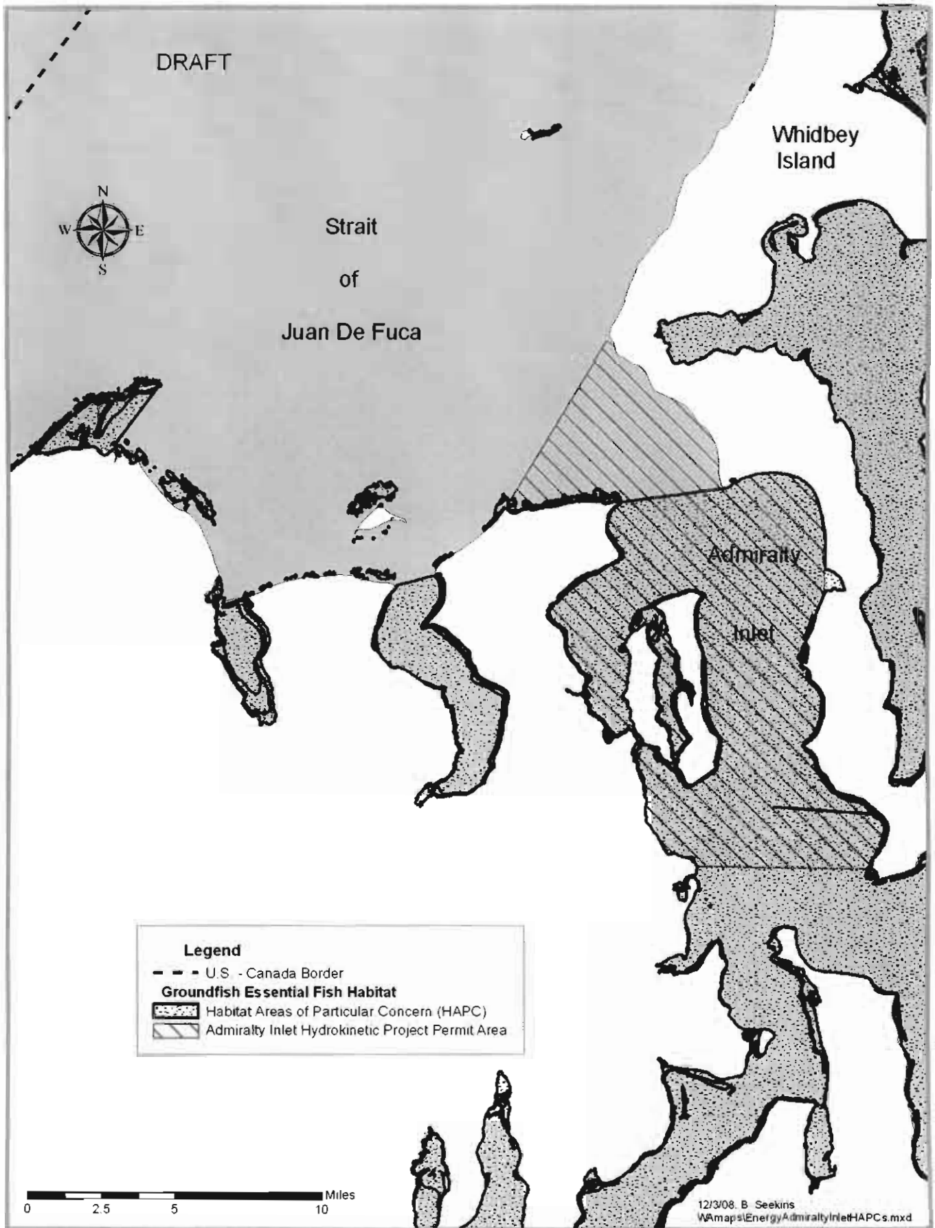
Figure 3. Habitat Areas of Particular Concern within Preliminary Permit Boundaries